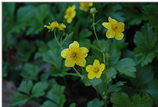
Barren Strawberry flowers