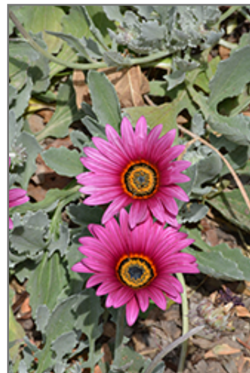
Big Magenta African Daisy flowers