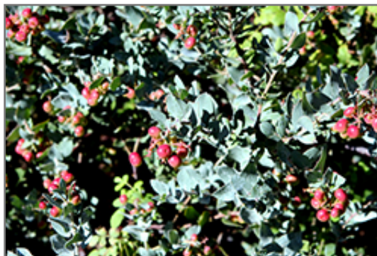
Lester Rowntree Manzanita fruit