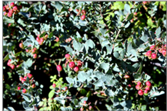
Lester Rowntree Manzanita fruit