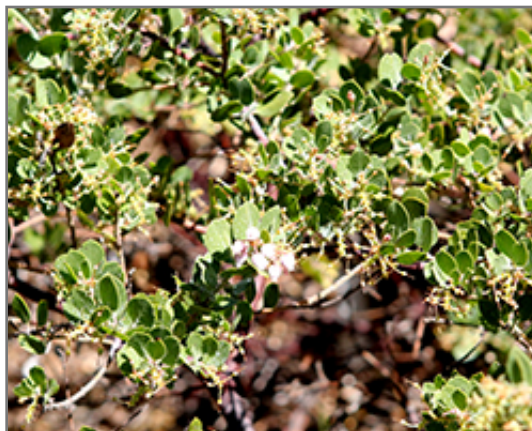
Big Sur Manzanita foliage