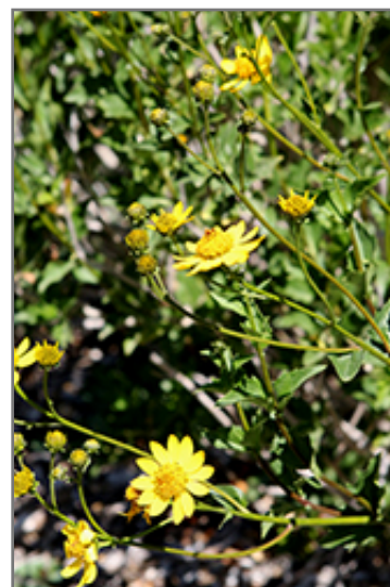
Cedros Island Crownbeard flowers

Cedros Island Crownbeard is recommended for the following landscape applications;