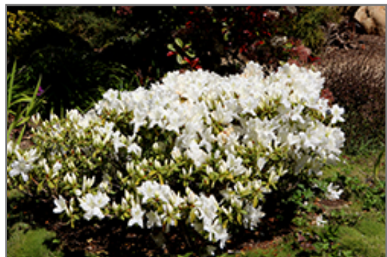
Shiro Kujaku Azalea in bloom