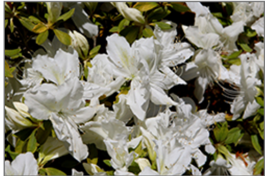
Shiro Kujaku Azalea flowers