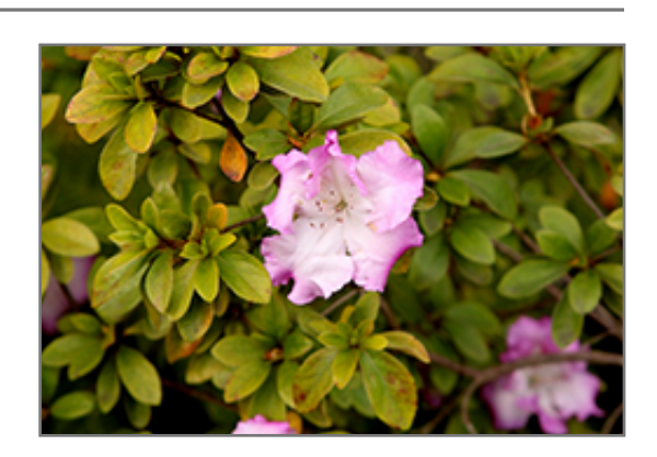
May Frills Azalea flowers

May Frills Azalea will grow to be about 5 feet tall at maturity, with a spread of 5 feet. It tends to be a little leggy, with a typical clearance of 1 foot from the ground, and is suitable for planting under power lines. It grows at a slow rate, and under ideal conditions can be expected to live for 40 years or more.