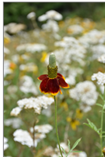
Red Midget Mexican Hat flowers