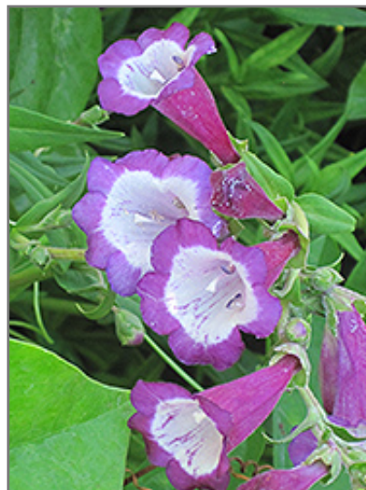
Midnight Beard Tongue flowers

Midnight Beard Tongue is recommended for the following landscape applications;