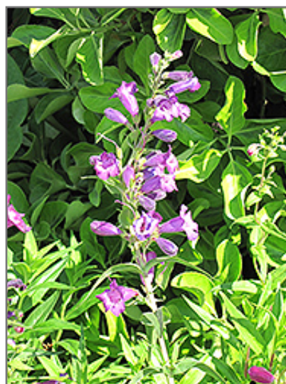
Midnight Beard Tongue flowers