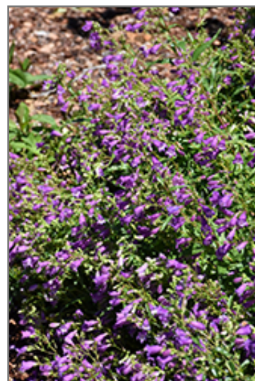
Little Bells Beard Tongue flowers

Little Bells Beard Tongue is recommended for the following landscape applications;