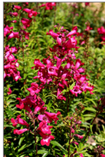
Super Star Beard Tongue flowers