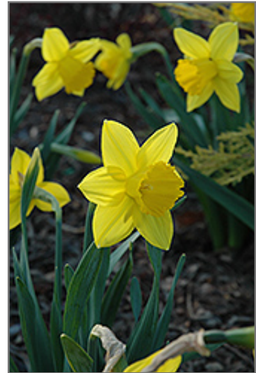
Arctic Gold Daffodil flowers