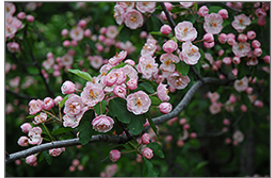
Bechtel's Flowering Crab flowers