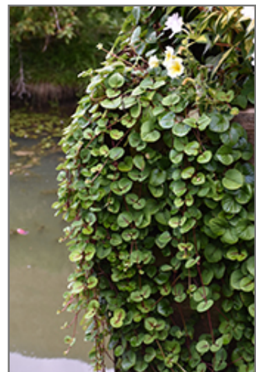
HILLIER Sunburst Moneywort