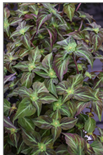
Night Light Moneywort foliage

Night Light Moneywort is recommended for the following landscape applications;