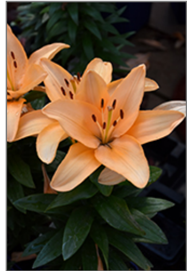
Lily Looks Tiny Moon Lily flowers