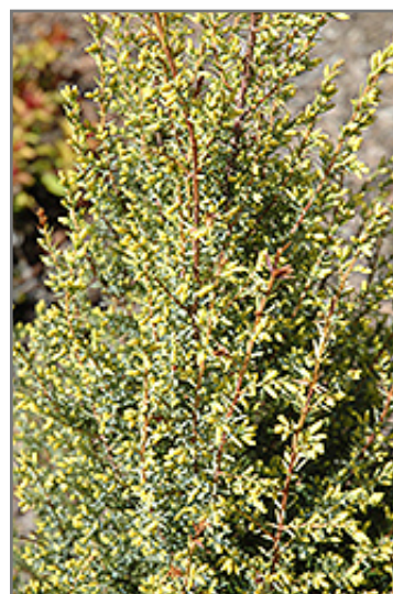
Gold Cone Juniper foliage