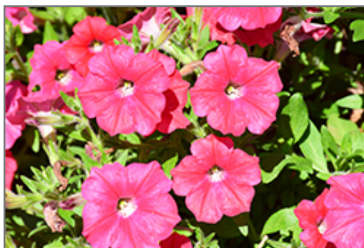
Opera Supreme Coral Petunia flowers