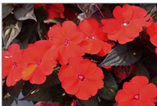
SunPatiens Compact Deep Red Impatiens flowers