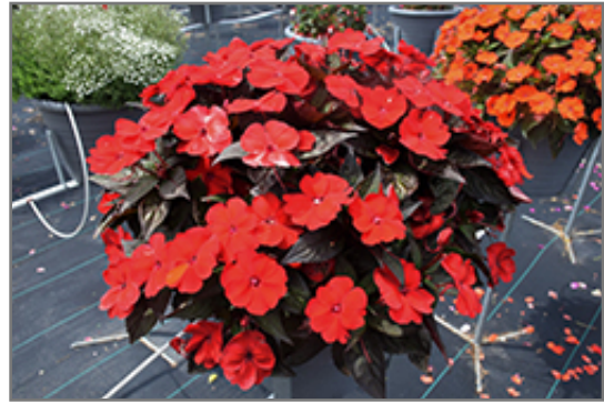
SunPatiens Compact Deep Red Impatiens in bloom

SunPatiens Compact Deep Red Impatiens will grow to be about 26 inches tall at maturity, with a spread of 24 inches. When grown in masses or used as a bedding plant, individual plants should be spaced approximately 22 inches apart. Its foliage tends to remain dense right to the ground, not requiring facer plants in front. This fast-growing annual will normally live for one full growing season, needing replacement the following year.