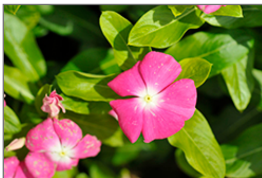
Pacifica XP Rose Halo Vinca flowers

Pacifica XP Rose Halo Vinca is recommended for the following landscape applications;