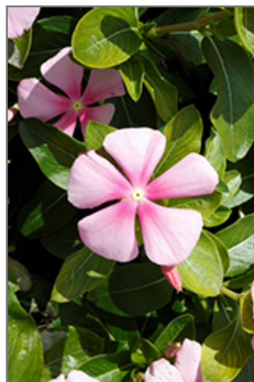
Pacifica XP Icy Pink Vinca flowers

Pacifica XP Icy Pink Vinca is recommended for the following landscape applications;