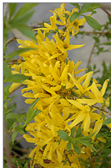
Gold Tide Forsythia flowers