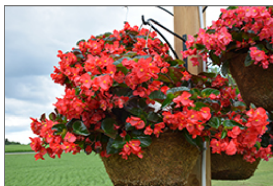
Viking Explorer Red on Green Begonia in bloom