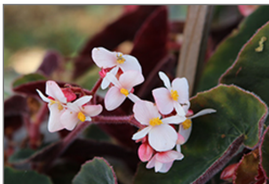
Ramirez Begonia flowers