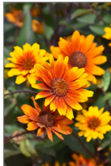
Summer Eclipse False Sunflower flowers

Summer Eclipse False Sunflower is recommended for the following landscape applications;