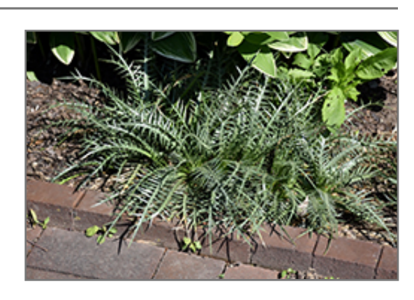
Mexican Sea Holly

A distinctive sea holly featuring symmetrical, spiny whorls of sea-green narrow foliage; tall stalks end in small, white, thistle-like flowers in early summer, that mature to a lovely brown in fall; tolerates hot dry sites; great in mass plantings