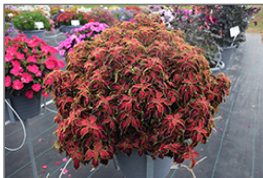
PartyTime Ruby Punch Coleus