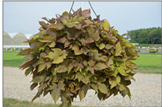
Floramia Verdino Sweet Potato Vine

Floramia Verdino Sweet Potato Vine will grow to be about 8 inches tall at maturity, with a spread of 24 inches. When grown in masses or used as a bedding plant, individual plants should be spaced approximately 20 inches apart. Its foliage tends to remain low and dense right to the ground. This fast-growing annual will normally live for one full growing season, needing replacement the following year.