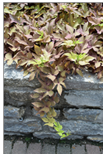
Floramia Verdino Sweet Potato Vine