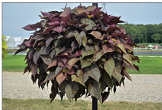
Floramia Rosso Sweet Potato Vine