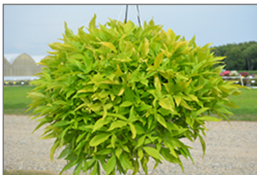
Floramia Limon Sweet Potato Vine