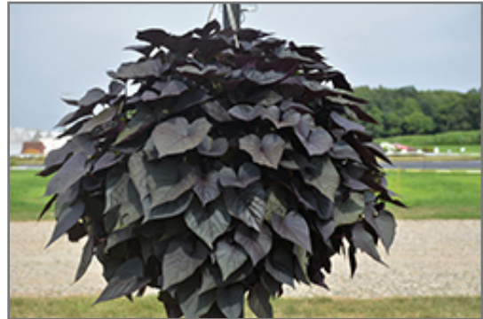
Floramia Cameo Sweet Potato Vine