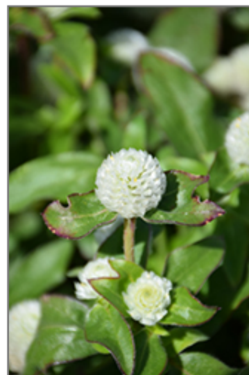
Gnome White Gomphrena flowers

Gnome White Gomphrena is recommended for the following landscape applications;