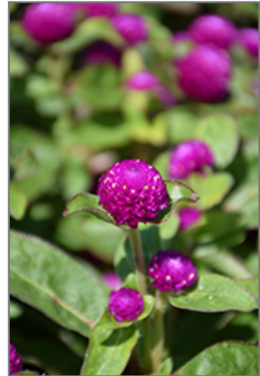
Gnome Purple Gomphrena flowers

Gnome Purple Gomphrena is recommended for the following landscape applications;