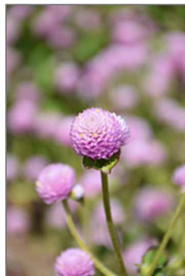
Gnome Pink Gomphrena flowers

Gnome Pink Gomphrena is recommended for the following landscape applications;