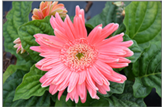
Floriline Midi Pink Gerbera Daisy flowers