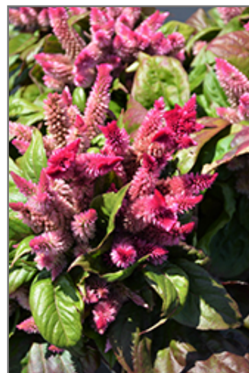
Kosmo Pink Celosia flowers

Kosmo Pink Celosia is recommended for the following landscape applications;