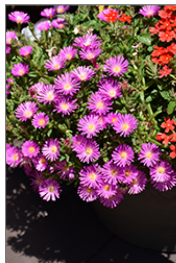
Ocean Sunset Violet Ice Plant flowers