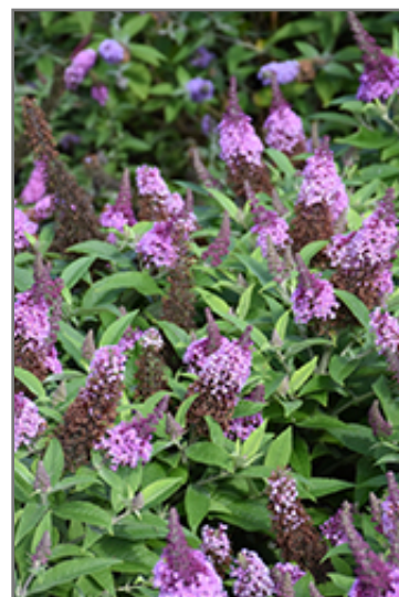
Chrysalis Pink Butterfly Bush flowers