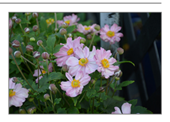
Fantasy Pocahontas Anemone flowers

Fantasy Pocahontas Anemone is recommended for the following landscape applications;