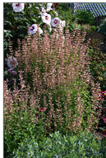
Meant To Bee Queen Nectarine Anise Hyssop in bloom

Meant To Bee Queen Nectarine Anise Hyssop is a fine choice for the garden, but it is also a good selection for planting in outdoor pots and containers. With its upright habit of growth, it is best suited for use as a 'thriller' in the 'spiller-thriller-filler' container combination; plant it near the center of the pot, surrounded by smaller plants and those that spill over the edges. It is even sizeable enough that it can be grown alone in a suitable container. Note that when growing plants in outdoor containers and baskets, they may require more frequent waterings than they would in the yard or garden.