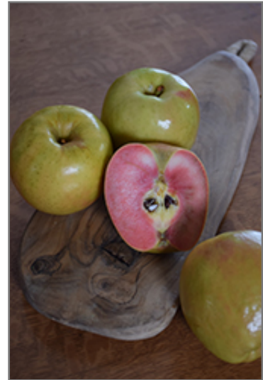
Airlie Red Flesh Apple fruit and flesh

Airlie Red Flesh Apple features showy clusters of lightly-scented white flowers with shell pink overtones along the branches in mid spring, which emerge from distinctive red flower buds. It has forest green deciduous foliage. The pointy leaves turn yellow in fall. The fruits are showy yellow apples with a red blush, which are carried in abundance from late summer to early fall. The fruit can be messy if allowed to drop on the lawn or walkways, and may require occasional clean-up.