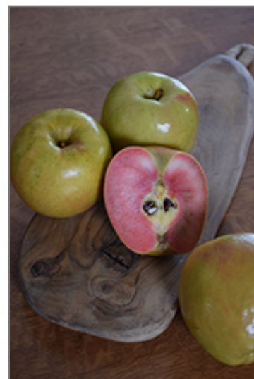
Airlie Red Flesh Apple fruit and flesh

Airlie Red Flesh Apple features showy clusters of lightly-scented white flowers with shell pink overtones along the branches in mid spring, which emerge from distinctive red flower buds. It has forest green deciduous foliage. The pointy leaves turn yellow in fall. The fruits are showy yellow apples with a red blush, which are carried in abundance from late summer to early fall. The fruit can be messy if allowed to drop on the lawn or walkways, and may require occasional clean-up.