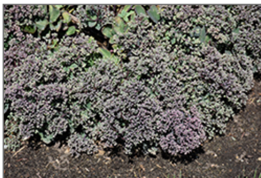
Rosy Cheeks Stonecrop in bloom

Rosy Cheeks Stonecrop is recommended for the following landscape applications;