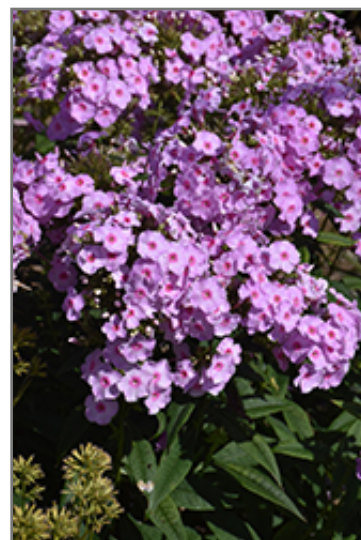
Luminary Opalescence Garden Phlox flowers

Luminary Opalescence Garden Phlox is recommended for the following landscape applications;