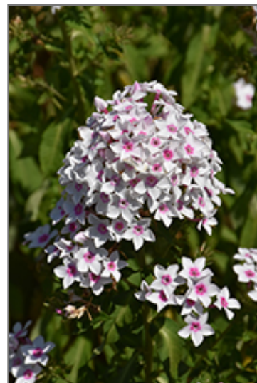
Cherry Cream Garden Phlox flowers

Cherry Cream Garden Phlox is recommended for the following landscape applications;