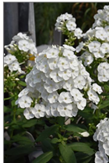
Luminary Backlight Garden Phlox flowers

Luminary Backlight Garden Phlox is recommended for the following landscape applications;