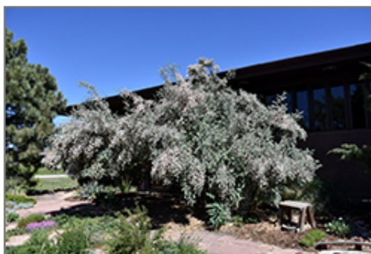
Blue Velvet Honeysuckle in bloom