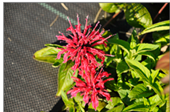
BeeMine Red Beebalm flowers