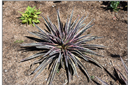
Art Deco Mangave