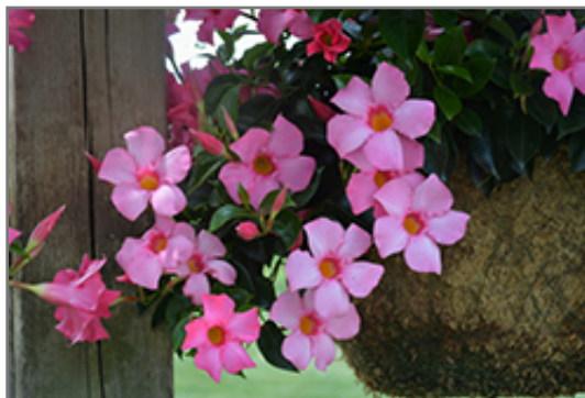
Diamantina Tourmaline Pink Bush Mandevilla flowers

This plant does best in full sun to partial shade. It prefers to grow in average to moist conditions, and shouldn't be allowed to dry out. It is not particular as to soil pH, but grows best in rich soils. It is highly tolerant of urban pollution and will even thrive in inner city environments. This particular variety is an interspecific hybrid, and parts of it are known to be toxic to humans and animals, so care should be exercised in planting it around children and pets. It can be propagated by cuttings; however, as a cultivated variety, be aware that it may be subject to certain restrictions or prohibitions on propagation.