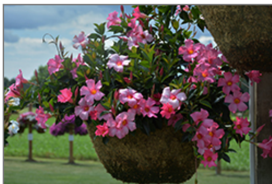
Diamantina Tourmaline Pink Bush Mandevilla in bloom