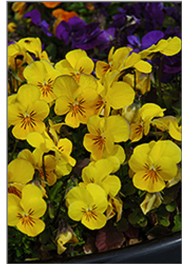
Penny Yellow Pansy flowers

Penny Yellow Pansy is recommended for the following landscape applications;