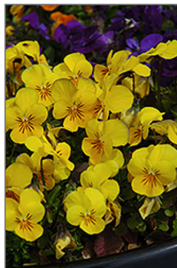
Penny Yellow Pansy flowers

Penny Yellow Pansy is recommended for the following landscape applications;